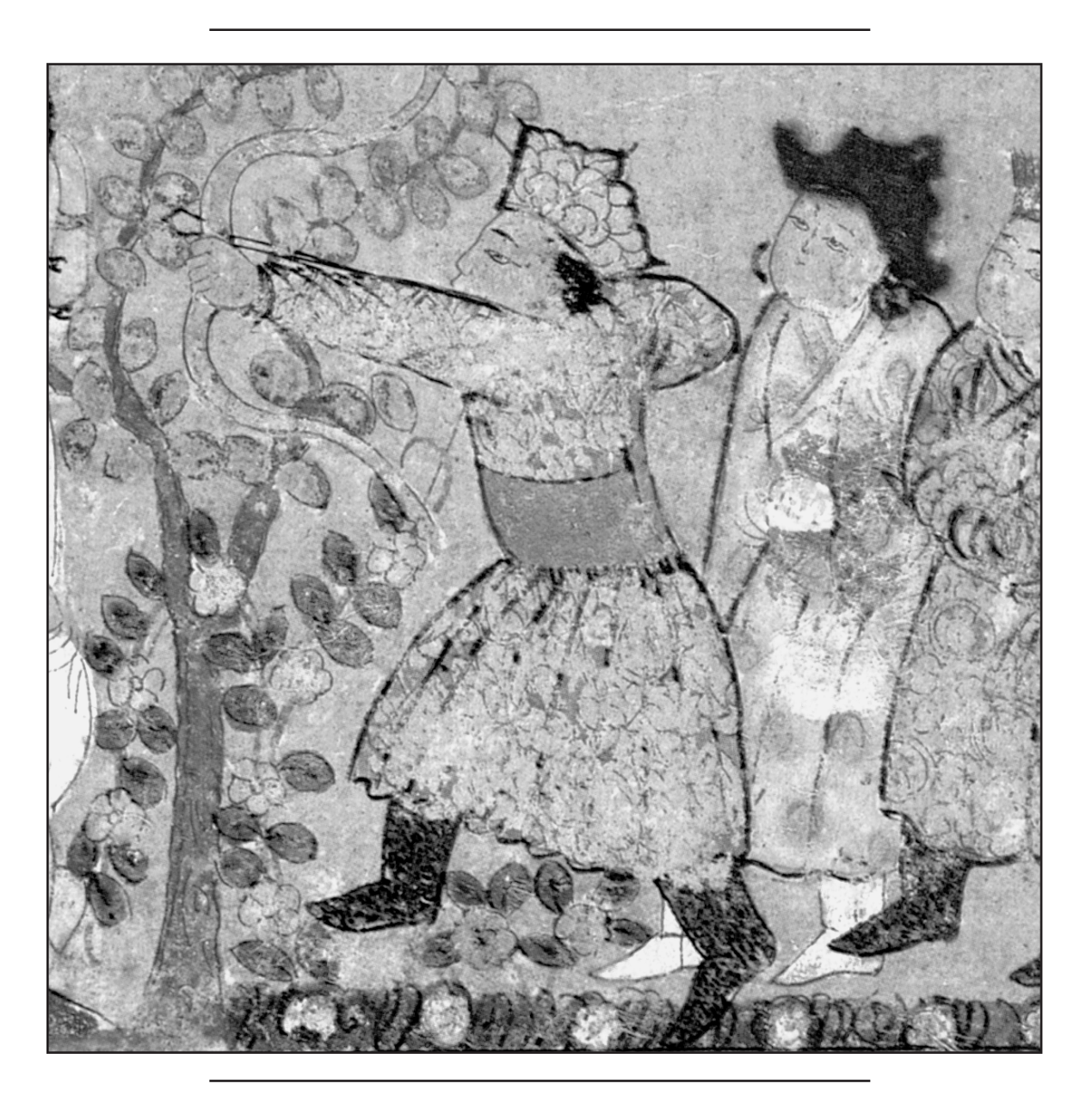
A Document Based Question (DBQ) World History